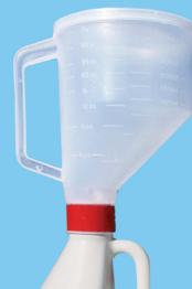
NEW FUNNEL RXFUN32