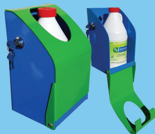
NEW SECURE RX DESTROYER™ LOCKBOX 64 OZ & 1 GALLON BOTTLE RX64LCKBX / RX1.0LCKBX