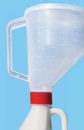
NEW FUNNEL RXFUN32