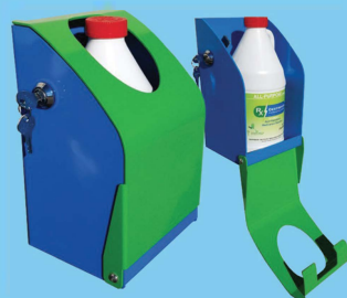
NEW SECURE RX DESTROYER™ LOCKBOX 64 OZ & 1 GALLON BOTTLE RX64LCKBX / RX1.0LCKBX